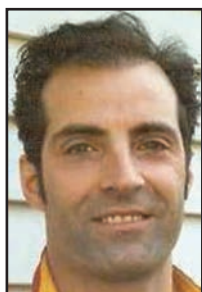
AFTER ONE SESSION