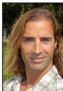
AFTER SECOND SESSION